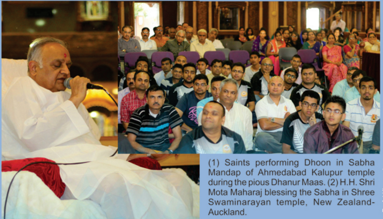
(1) Saints performing Dhoon in Sabha Mandap of Ahmedabad Kalupur temple during the pious Dhanur Maas. (2) H.H. Shri Mota Maharaj blessing the Sabha in Shree Swaminarayan temple, New Zealand-Auckland.